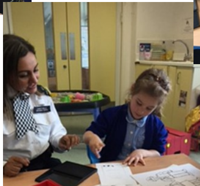
... the pupils loved dressing up in role - hello WPCs!