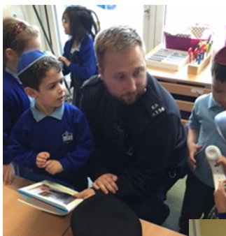
Community police officers visited our reception pupils and introduced PC Bear

Throughout all, a clear commitment has shone through to persevere, show ambition, energy and enthusiasm. Well done to all!