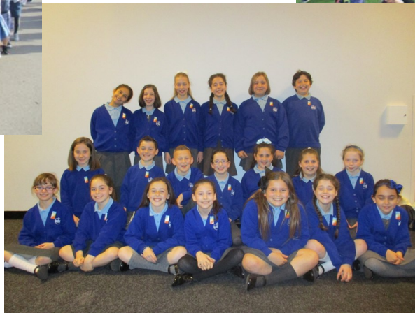
The School Choir at the Yom Hashoah event at Allianz Park