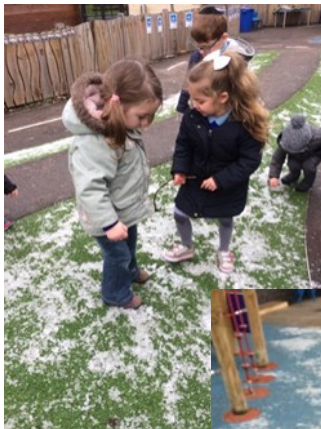
Reception pupils discovering and enjoying the snow at the start of term. Sadly not enough for a snowman this time...

Throughout all, a clear commitment has shone through to: persevere with ambition, energy and enthusiasm as great ambassadors for our school. Well done to all!