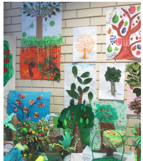
... and spring breaks forth, and the pupils's creativity blossoms for Tu Bishvat